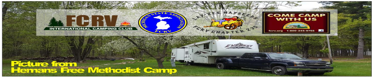
Picture from Hemans Free Methodist Camp