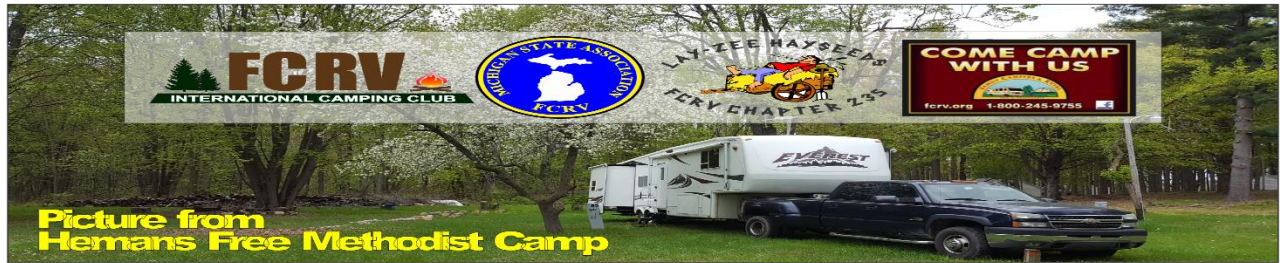
Picture from Hemans Free Methodist Camp