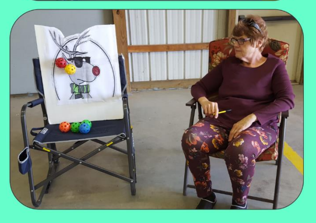
Page 2 of Pictures