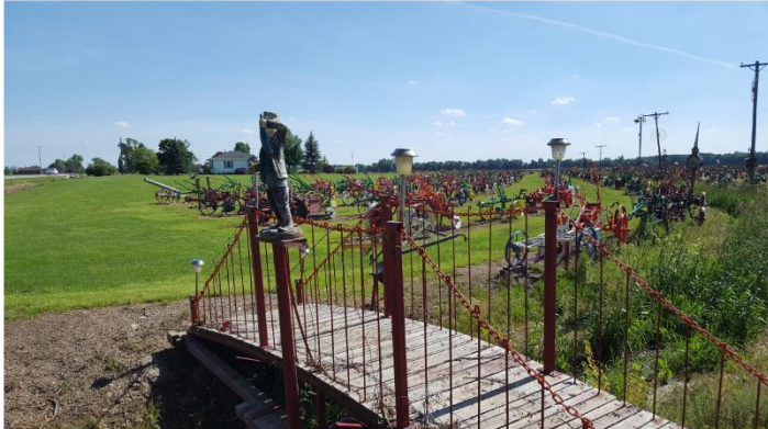
While you are there look at everything this outdoor museum has to offer!