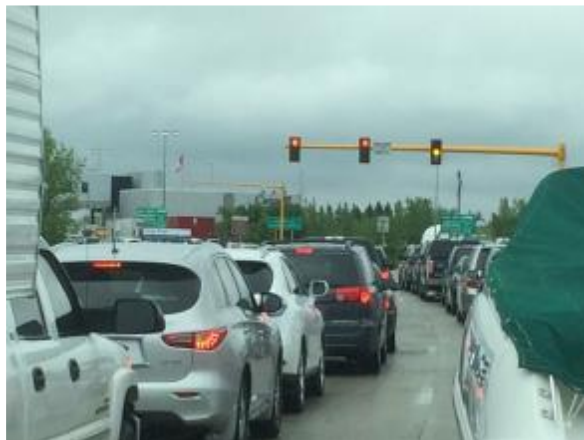
Waiting in line at the Canadian Border Crossing Pembina, North Dakota.

As far as guns are concerned, it's easiest to just leave them at home. If, however, you want to bring guns, there are ways to go about bringing certain firearms, but you must follow the law to the letter —and it will be a hassle.