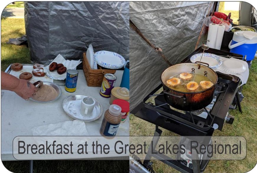
Breakfast at the Great Lakes Regional