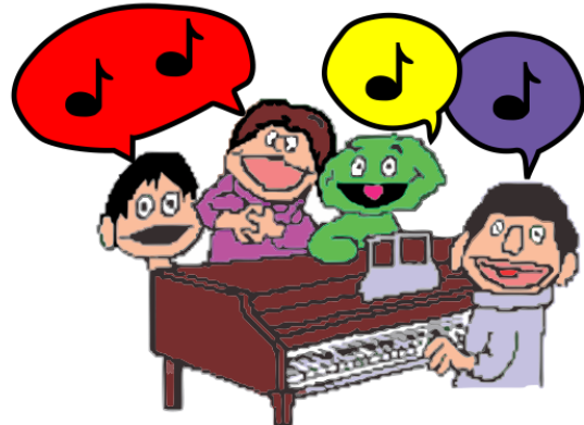
Praise Gang Puppeteers

In the last year the Praise Gang Puppeteers and the Lay-Zee Hayseeds have lost 5 members or former members.