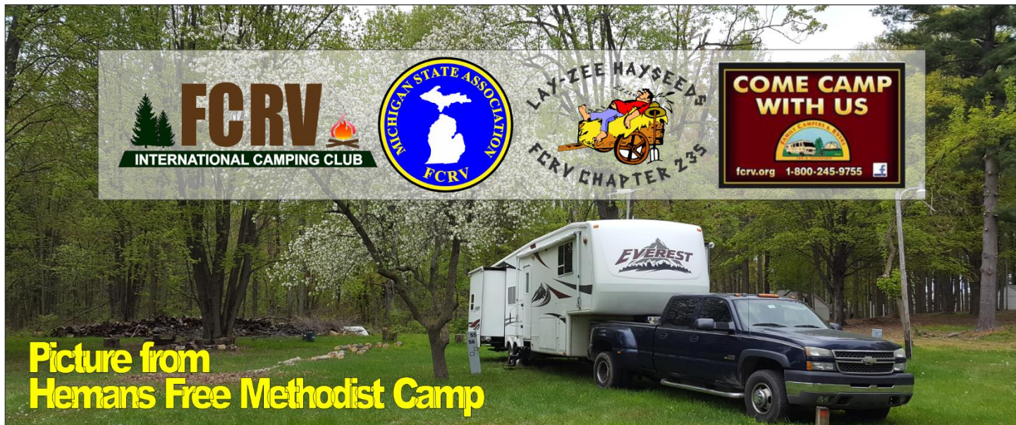
Picture from Hemans Free Methodist Camp