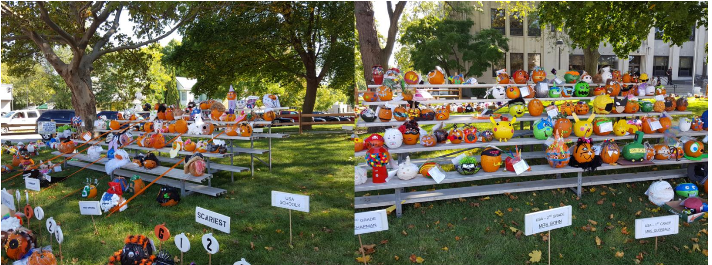
Caro Pumpkin Festival continued