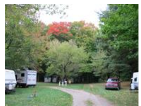
Hemans Free Methodist Campground

The Lay-Zee Hayseeds will be having their first campout Mother's Day weekend May 8-10, 2015 at the Hemans Free Methodist Campground. Projects include helping get the campground ready for the summer camping season. It is necessary to check and repair water leaks, fix any electrical problems, repair buildings, also trees and limbs that are down are cleaned up.