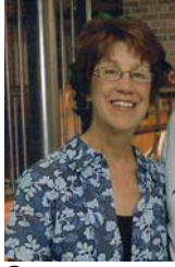
FCRV Corresponding Secretary