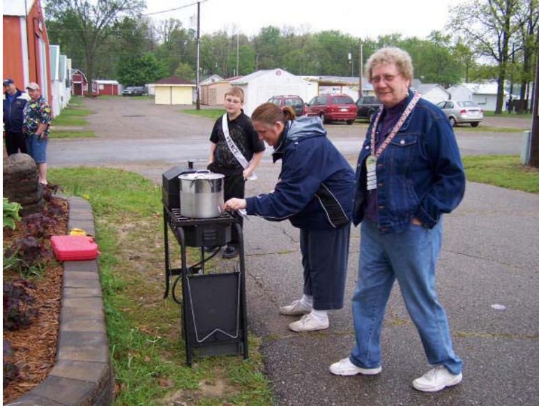
Teen & Double Digit Hot Dog Sale Preparation at the Spring Campout!