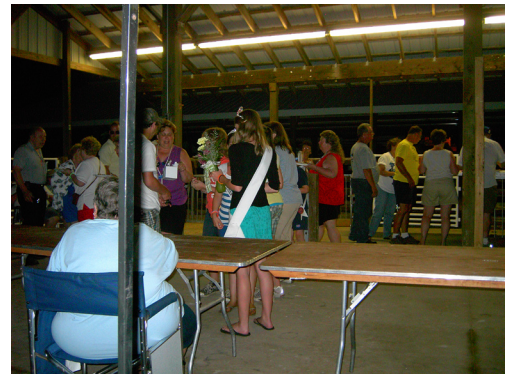
Michigan Get Together