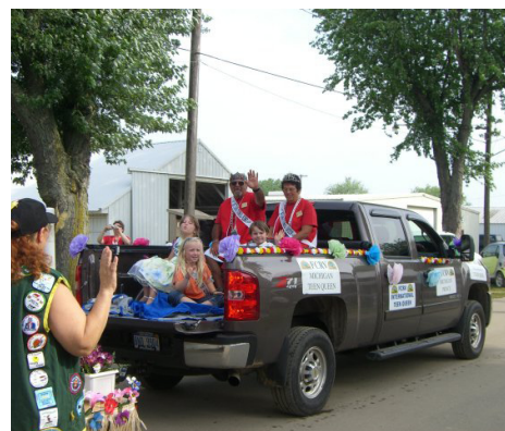
Michigan Royalty in FCRV Parade