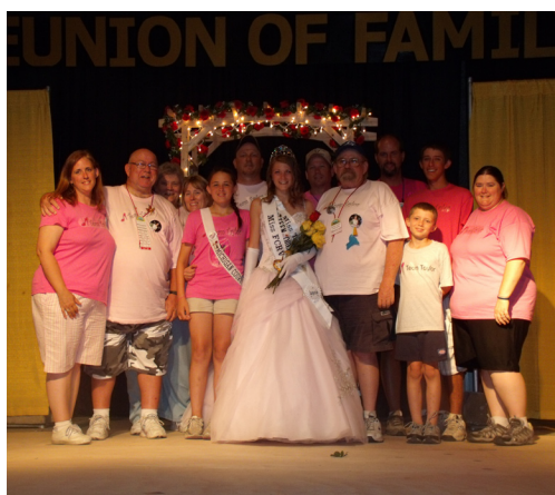
The Royal Extended Family