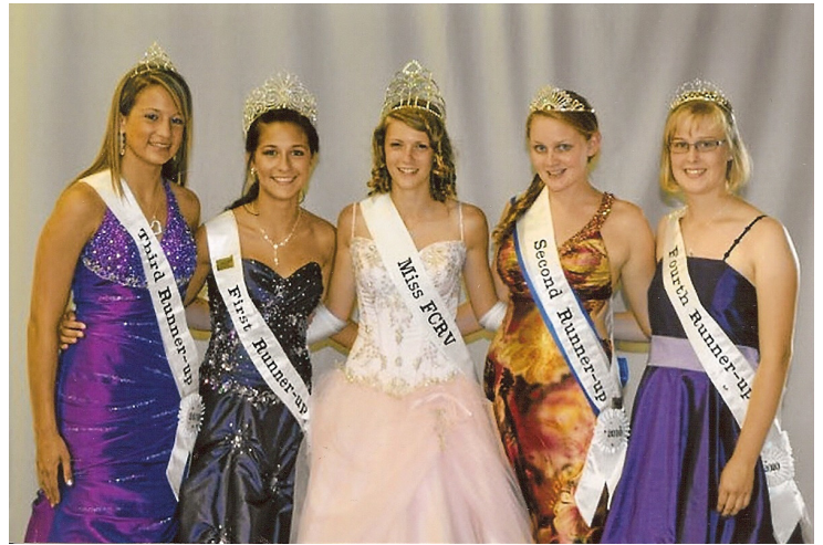
The FCRV Royal Court