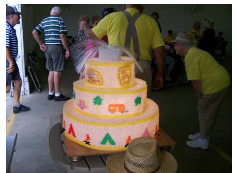
The Campvention 2010 Cake was made from plastic canvas and received a lot of attention.