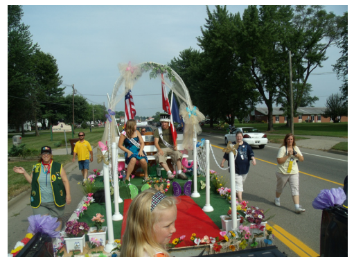
Michigan Float in Parade