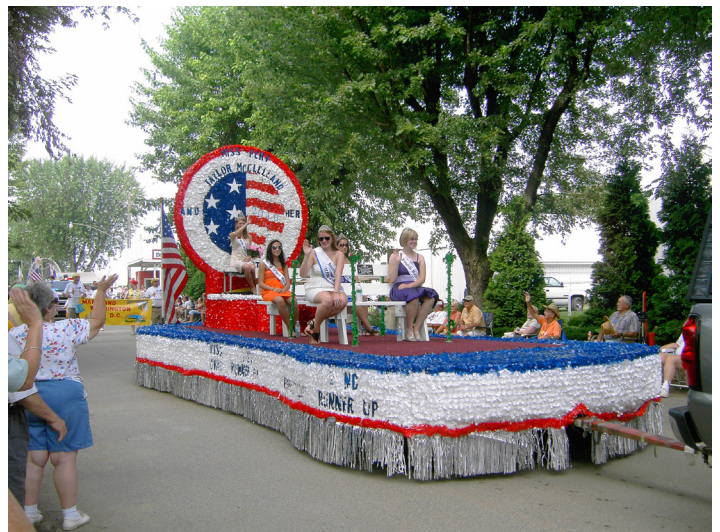
The International Teen Queen Court/Float