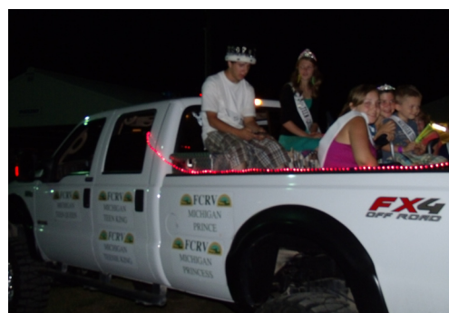
Michigan Royalty Noise Parade

The MICHIGAN STATE ASSOCIATION Congratulates its