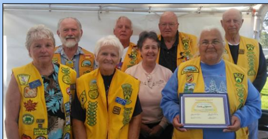
The Torch Lighters, Chapter 152, of the Blue Water District receive a certificate for 45 years in FCRV