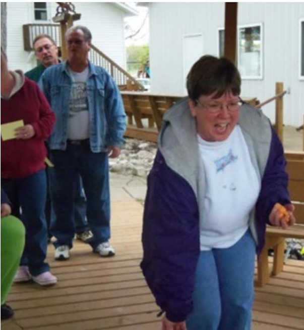
Having fun at family games at Spring campout.