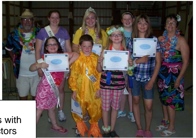
Northern District certificate winners with their District Directors