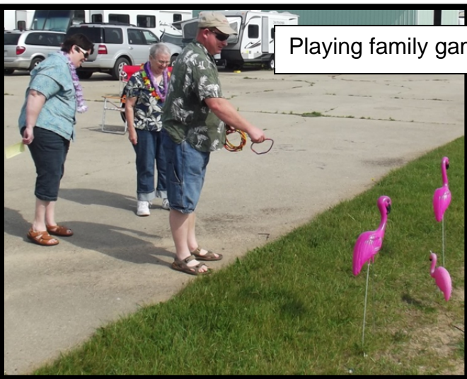
Playing family games