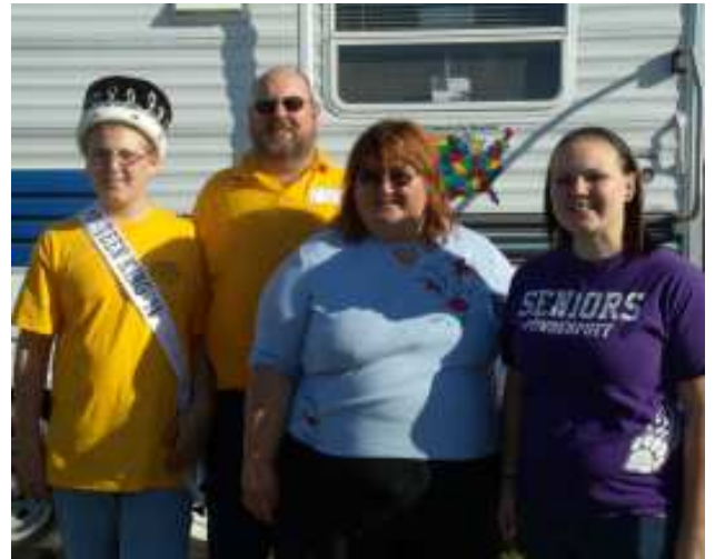
The Crookedacre Family Royalty