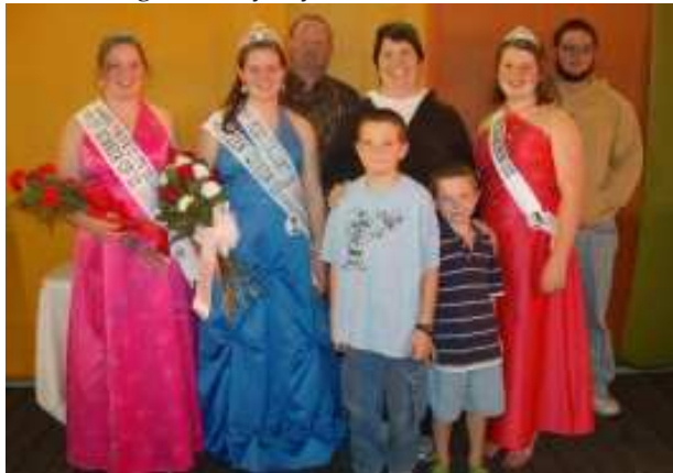
The Kurburski Family Royalty