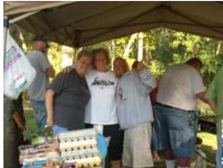
The Food Tent