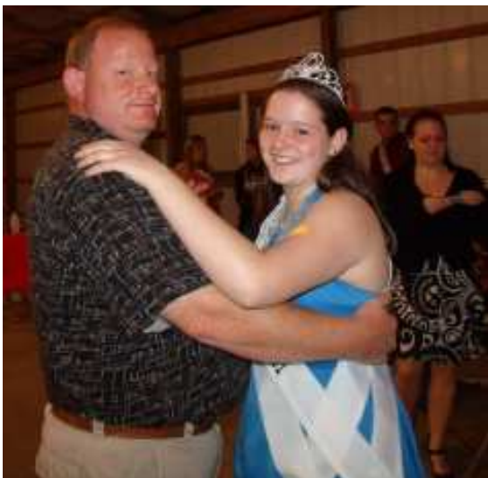
Dad and Teen Queen