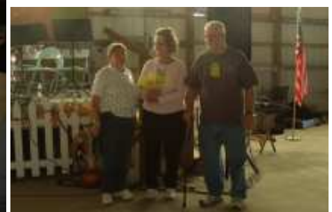
Passing the torch!