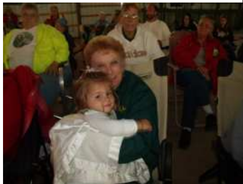
Enjoying the evening program!