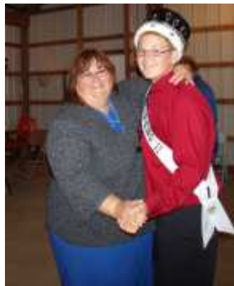
Mom and Teen King