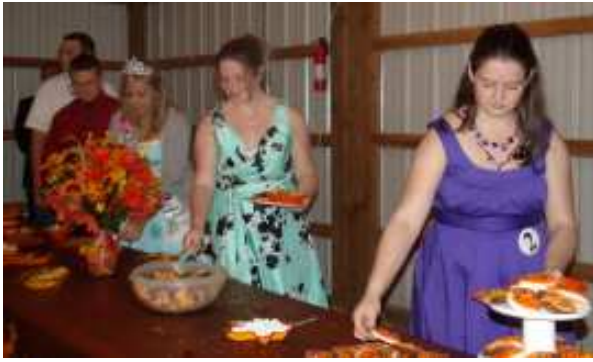
2011-12 Teen Pageant Contestants and 2010-11 Teen Pageant Royalty and Court