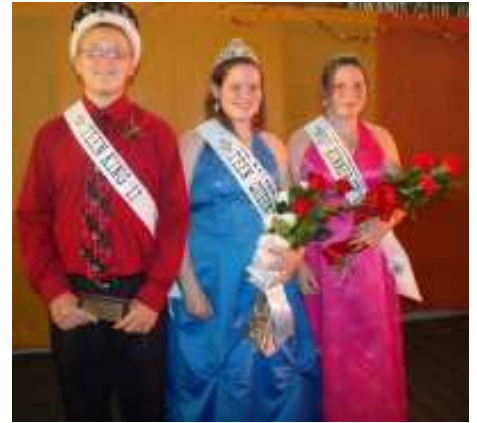
2011-12 Teen Royalty