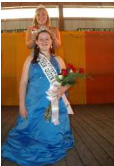
2010-11 Queen Brittany crowns