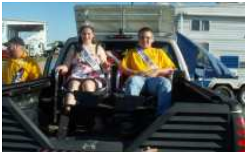
2011-12 Teen Royalty Noise Parade