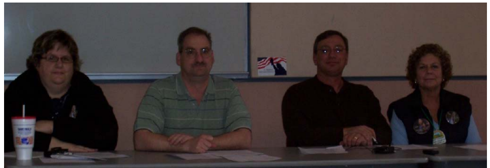
2009-11 Michigan State Association Executive Board

Snowbirds...please remember to reverse your Temporary Change of Address when you left Michigan for the winter!