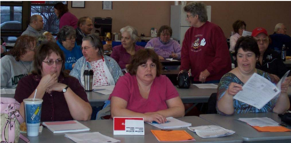
February 2011 MSA Delegate's Meeting