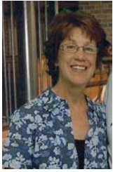
FCRV Corresponding Secretary