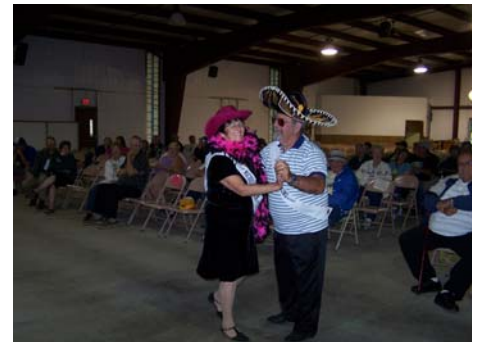
Evening Program song dedication to our Retiree Royalty